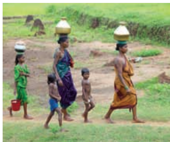
Participation could overburden women